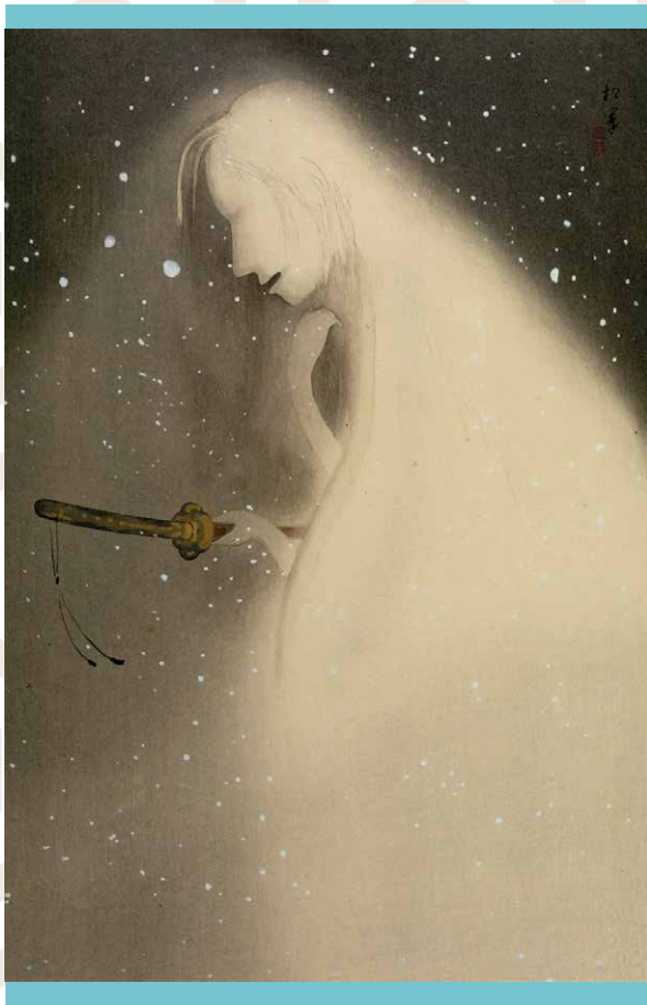
Uemura Shōen, The Snow Woman , 1922

Lafcadio Hearn (1854–1904) introduced Japanese culture to the West, beginning with his studies of voodoo in New Orleans before turning to Japanese ghost stories, folktales, and proverbs. Although often dismissed for its preoccupation with the exotic and criticised as "Orientalist," his work forms a vital bridge between cultures, preserving Japanese folklore while prefiguring the modern genre of folk horror.