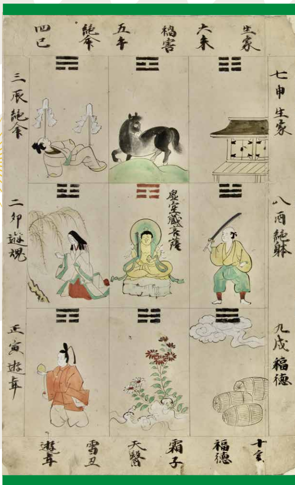
Yijing divination explained with pictures (易占画解), National Diet Library Shinjo collection

From day selection to weather forecasting, divination was widely used in Edo-period society, as evidenced by the variety of printed books and manuscripts produced on the subject. Many of these works include diagrams as well as images depicting the possible fates awaiting clients and readers. This lecture will sketch the history of such images, explore their distinctive features, and consider the role they may have played in shaping and disseminating social norms.